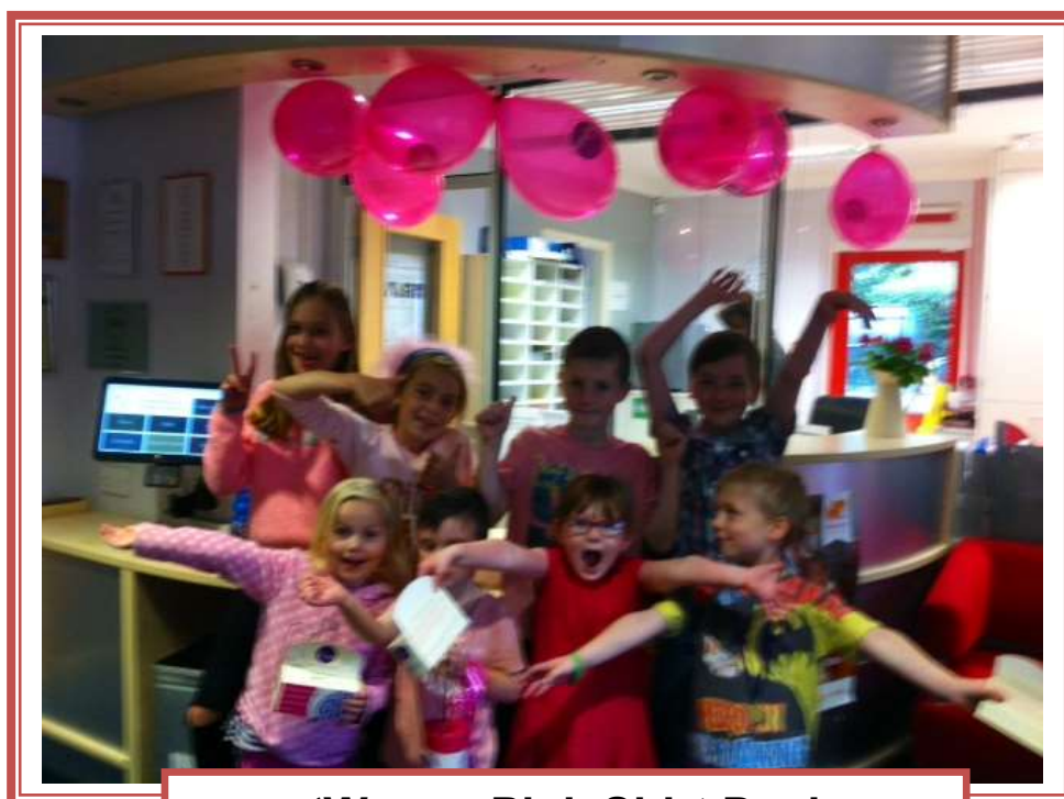
'Wear a Pink Shirt Day'