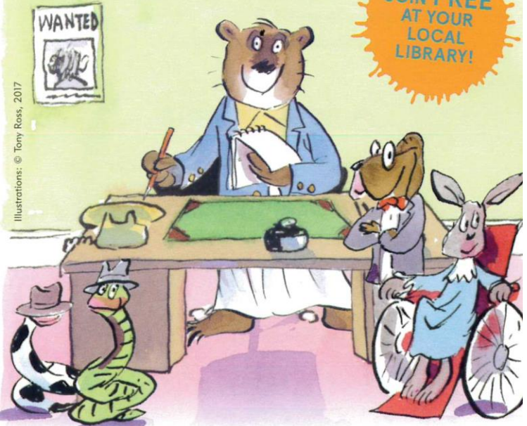
Illustrations: © Tony Ross, 2017