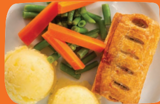
ON THE SIDE Vegetable of the day or salad