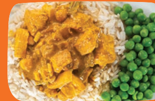
ON THE SIDE Vegetable of the day or salad