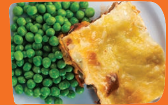
Baked battered fish and chips