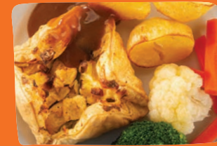
Sliced beef and Yorkshire pudding

CHOOSE FROM V Quorn and leek pastry crown