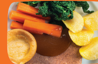
ON THE SIDE Roast potatoes, vegetable of the day and gravy