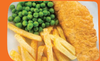
ON THE SIDE Vegetable of the day or salad