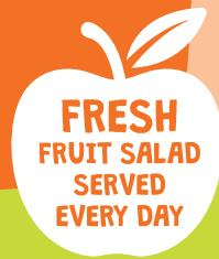
TO FINISH Freshly baked shortbread