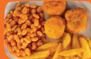
ON THE SIDE Crinkle cut wedges and vegetable of the day or salad