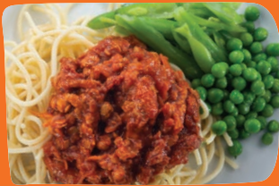
Pork sausage roll with mashed potato