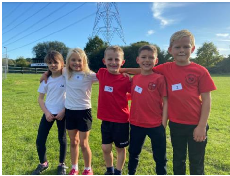
Year 2 Cross Country