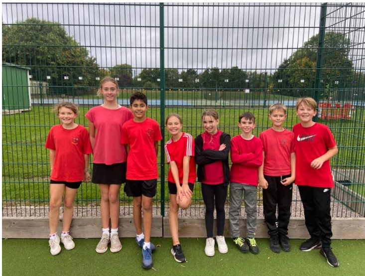
Year 6 Dodgeball