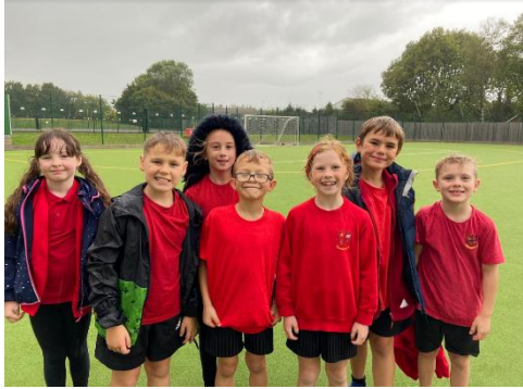
Year 4 Dodgeball