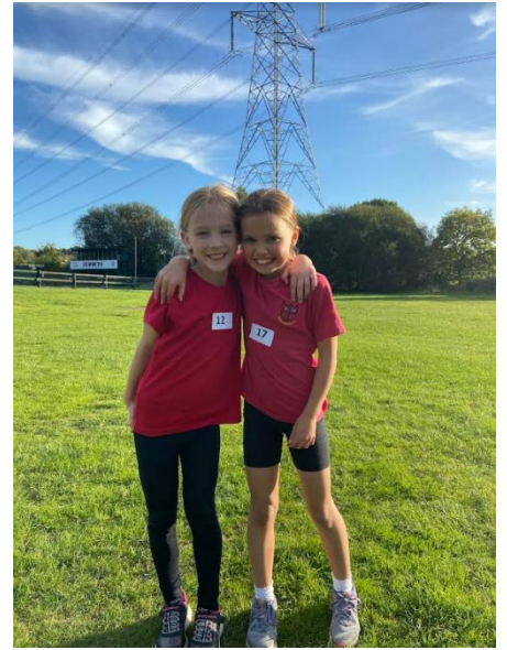
Year 3 Cross Country