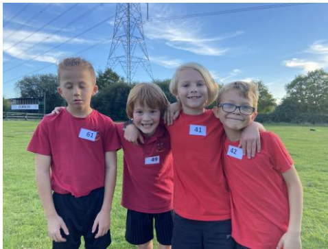
Year 4 Boys Cross Country