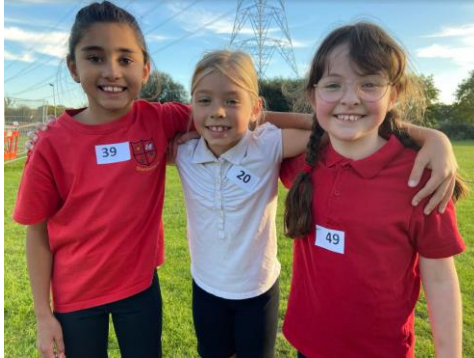
Year 4 Girls Cross Country